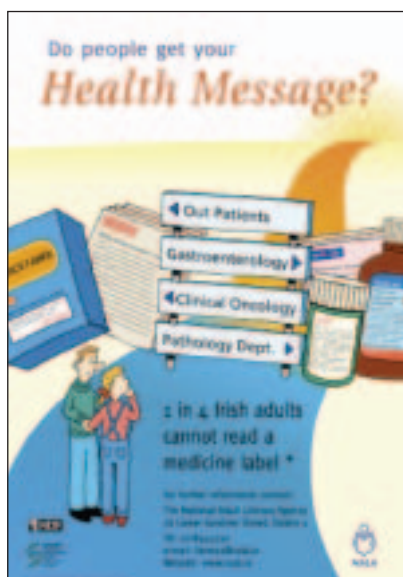
A poster from the Irish Health Literacy campaign